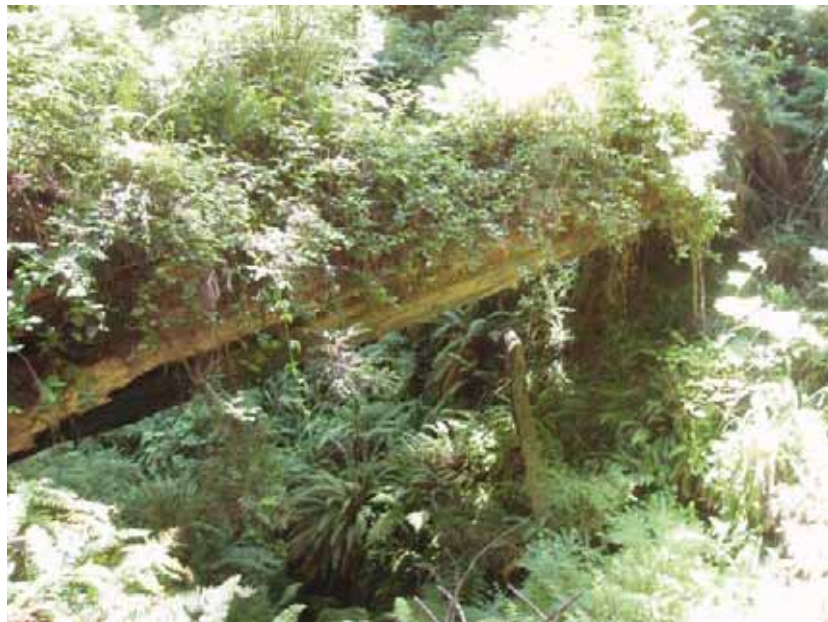
Nurse log – a rotting log that supports a variety of plants