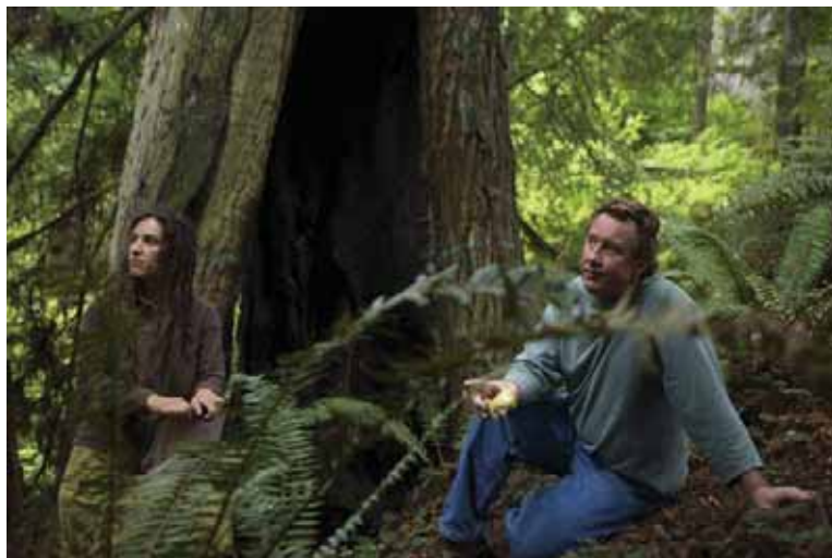
This goosepen is on HRC property