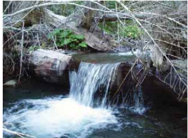
Large woody debris contributes to enhanced stream function for fish habitat – this plunge pool is on Nelson Creek