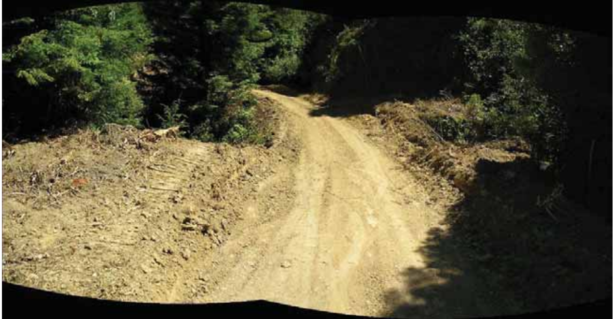
Two stream crossings on this old road are “Humboldt” crossings – wood and soil dumped into the channels many years ago. This panorama shows the site after the vegetation has been removed to allow access for heavy equipment.