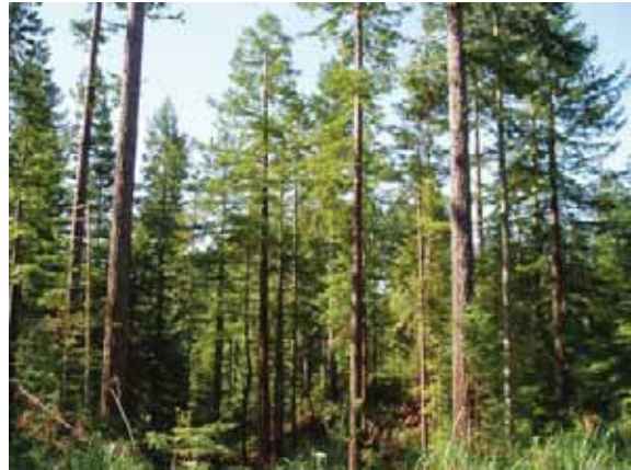
Redwood stand remaining after harvest

Selection silviculture is used primarily to thin conifer-dominated stands of redwood or Douglas-fir, or very young, dense stands of redwood or Douglas-fir. Redwood at any age, and young Douglas-fir up to around 60 years old, will respond well to a stand thinning harvest by increasing its annual growth shown by the wider growth rings in the photos below. This “release” growth is in response to greater access to sun and less competition for nutrients. Periodic selection harvests (every 15-20 years) encourage tree growth while allowing the remaining trees to fill small gaps created by harvest.