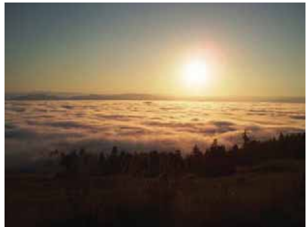
Summer fog on the Mattole River