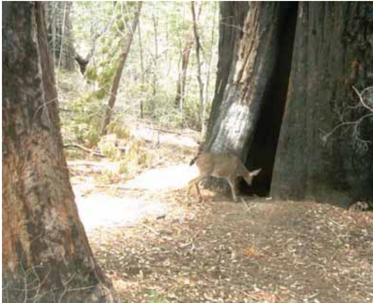
A goosepen, located within Humboldt Redwood State Park just south of Humboldt Redwood Company land, is very uncommon as it contains a spring

Burned-out basal cavities in trees are known as “goosepens.” These important wildlife habitat structures in the forest were used by early ranchers to pen their geese at night. Goosepens provide habitat for bats, birds, and small and medium-sized mammals. HRC’s timber marking process used during timber harvesting plan layout puts a high value to retention of trees with goosepens. Most goosepens are found in trees with fairly large diameter (conifers greater than 36 inches diameter breast height [DBH] or hardwoods greater than 24 inches DBH).