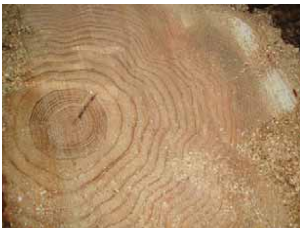
Tree cross-section showing “release” of growth after a harvest entry in the 1960’s

Selection silviculture is used primarily to thin conifer-dominated stands of redwood or Douglas-fir, or very young, dense stands of redwood or Douglas-fir. Redwood at any age, and young Douglas-fir up to around 60 years old, will respond well to a stand thinning harvest by increasing its annual growth shown by the wider growth rings in the photos below. This “release” growth is in response to greater access to sun and less competition for nutrients. Periodic selection harvests (every 15-20 years) encourage tree growth while allowing the remaining trees to fill small gaps created by harvest.