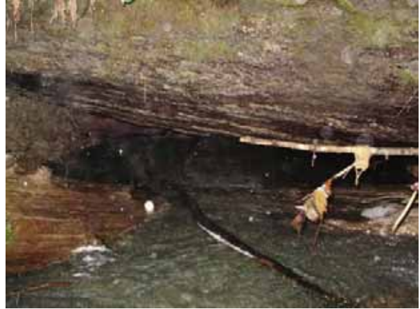
Looking underneath, you can see the redwood logs half-buried in the stream bed – after consultation with State agencies, the decision was made to fix the site during the winter