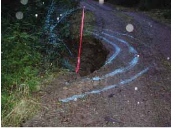
This failing Humboldt “bridge” was discovered on January 7, 2009 during our normal winter road monitoring; the fill had washed away resulting in this dangerous sinkhole in the road