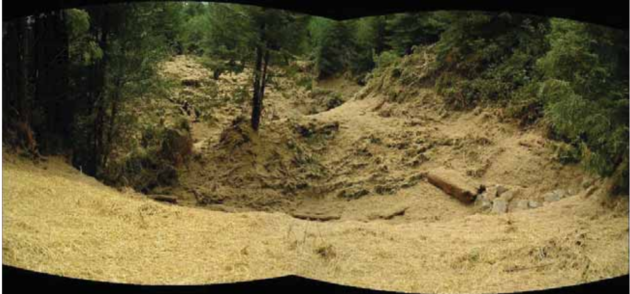
The same two crossings after the restoration work was completed. Note the rock protecting the upstream part of the channel and the slash (small trees and limbs) providing bank stabilization. The larger wood chunks were excavated from the crossing. Straw covers all bare soil for erosion control.