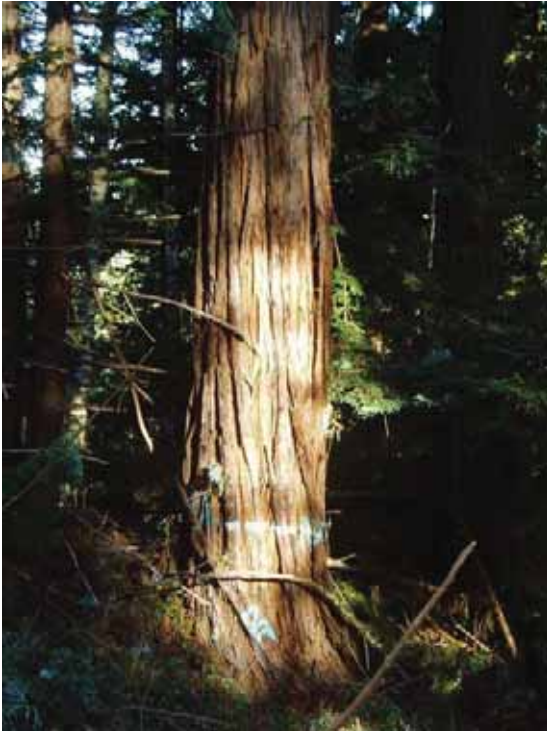
Retained old-growth redwood in Root Creek – note original mark has been painted over and “NC” for “no-cut” prominently painted on bole

the forest to provide large wood on the forest floor. Old-growth trees mistakenly cut due to misjudgment of age will also be left in the woods.