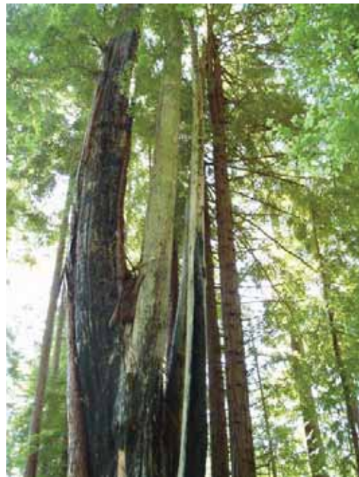
A live redwood tree with complex structure