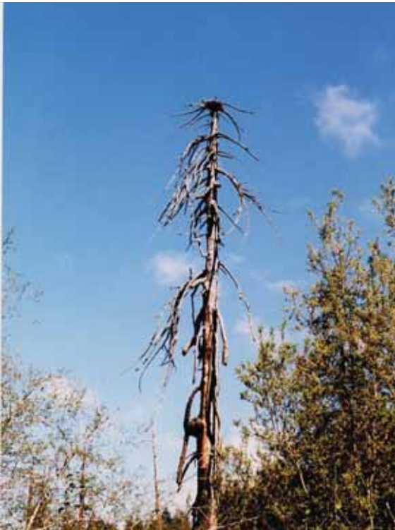
This snag contains an osprey nest