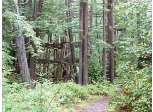
Remnants of an old RR trestle at Bridge Creek