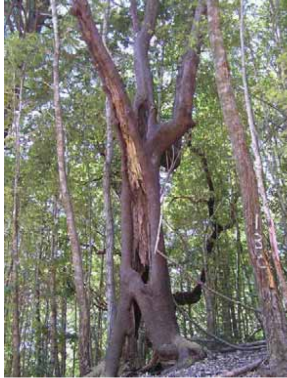
Madrone with complex structure in Happy Valley