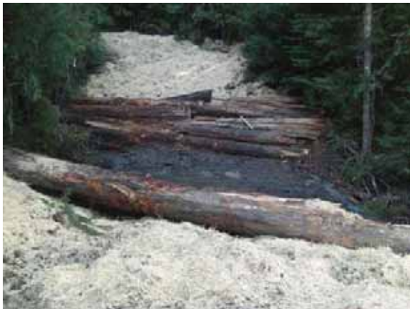
Same site on January 19, 2009 after pulling the wood and soil out of the stream – note the straw mulch placed on disturbed soil