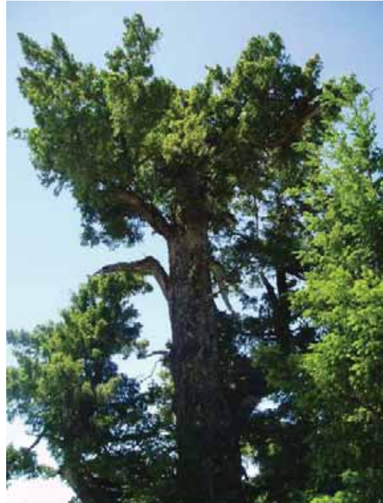
Old-growth Douglas-fir in the Bear River drainage, retained with screen trees