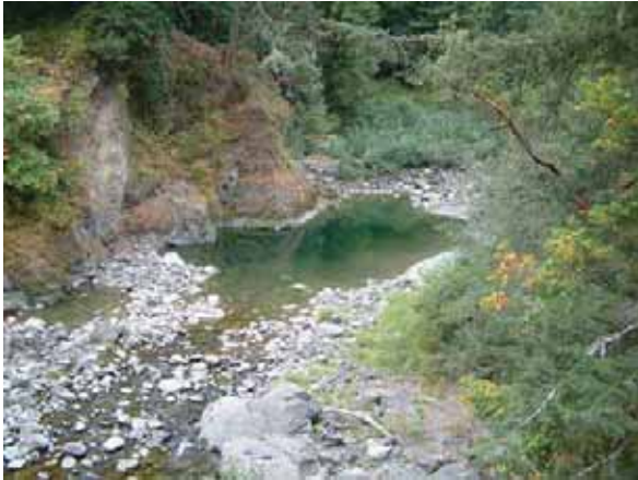
Yager Creek in September 2007