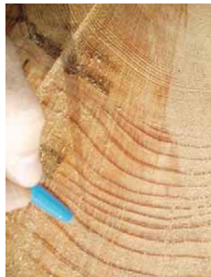
Growth ring size changes after release