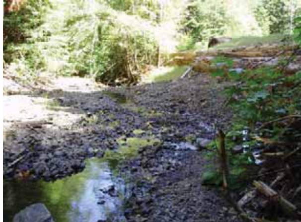
July 21, 2009 – note the clear rocky stream bed and the grass growing where the soil was mulched above the logs and on the bank downstream

Some roads are scheduled for permanent closure. All the culverts and associated dirt fill are removed, and the stream crossings are reshaped to be as close as possible to the natural streambed grade. The banks are protected and armored against erosion using straw mulch, rocks, slash, and logs as needed depending on the size of the site. The photos below show such a “pulled” crossing on a permanently closed road.