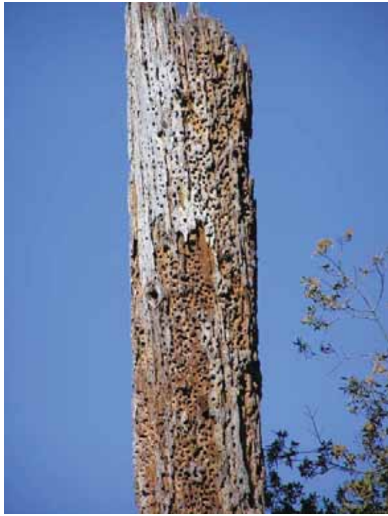
Acorn woodpecker granary snag