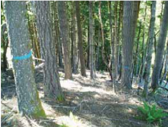
Douglas-fir stand marked for selection harvest

Selection harvest – HRC’s preferred harvesting technique in well-stocked stands