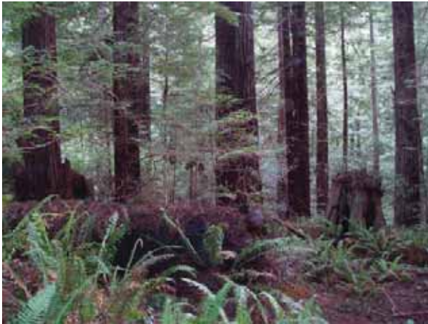
Rotting logs and stumps on the forest floor provide nutrient cycling and habitat for many kinds of organisms

Large woody debris (LWD) on the forest floor is important for nutrient cycling, soil protection, and as habitat for a variety of organisms. Woody debris provides an important micro-climate for fungi, mosses, invertebrates, and amphibians, and valuable feeding and hiding areas for mammals. The photo below left shows downed woody debris that may be used as a biological anchor for a retained area in a variable retention harvest. Other biological anchors include snags, hard-to-replace complex tree structures, and rare plant protection buffers. The photo below right shows LWD contributing to pool development in a stream. The bottom photo is of a “nurse log” supporting huckleberry and ferns, among other plants, and providing habitat for other organisms.