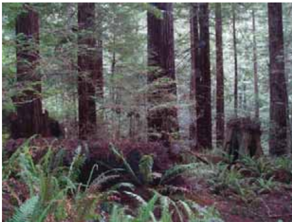
Forest above Strongs Creek