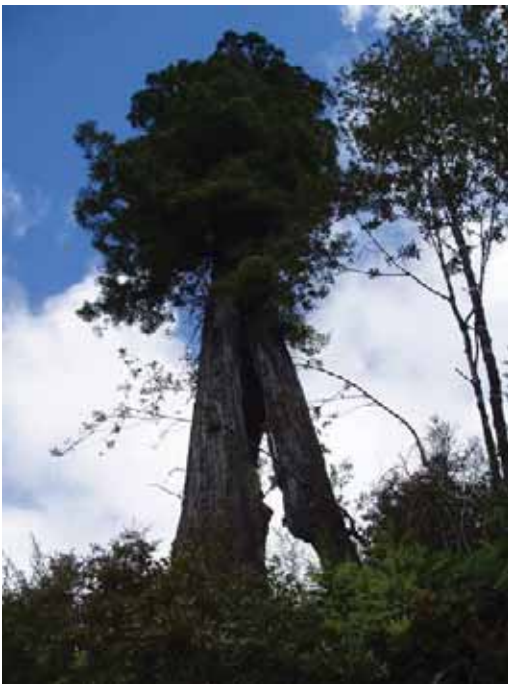
Live trees with complex structure important to wildlife are retained

Live trees with complex structure (e.g. broken, multiple or dead tops, cavities, etc.) are also important for wildlife. These high-value wildlife trees are referred to by the HCP as "live culls." In addition to the snag/snag replacement tree retention requirements of the HCP, to the extent they exist, up to four "live cull" green trees per acre averaged over the THP unit are marked for long-term retention. Large hardwood trees over 30 inches diameter breast height (DBH) are also retained, up to an average of two per acre. In addition, HRC voluntarily maps and protects regionally significant forest types such as true oak forest.