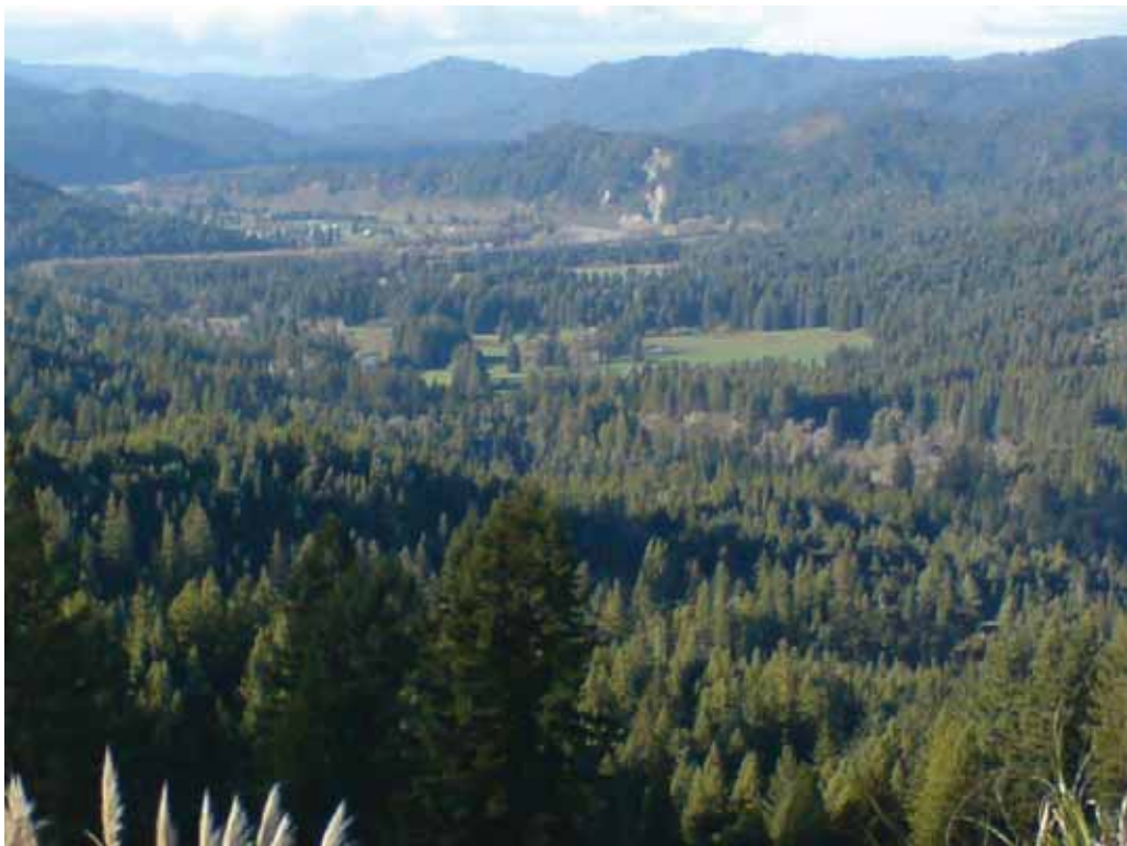
Larabee Creek and the Eel River

To arrange a visit or tour, please call us or contact us via our web site.