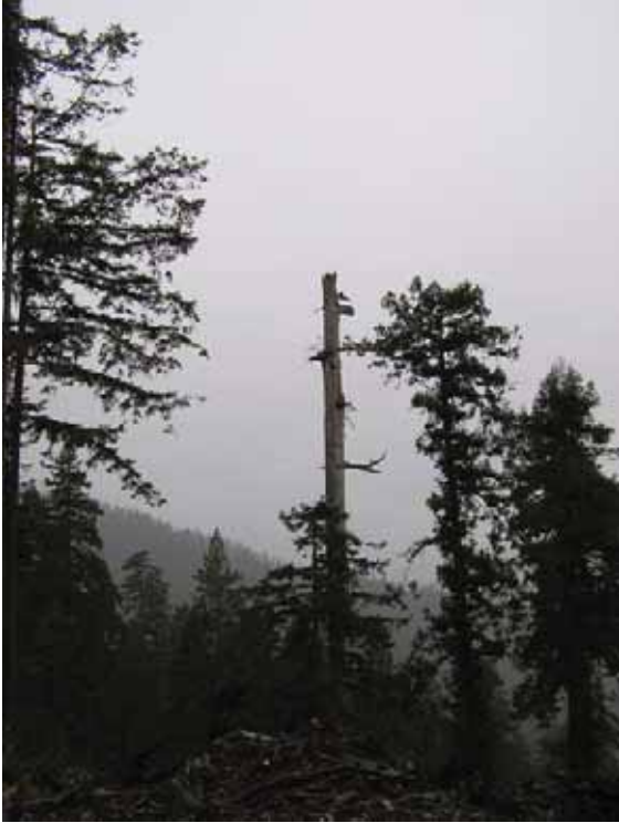
Snags are important to wildlife