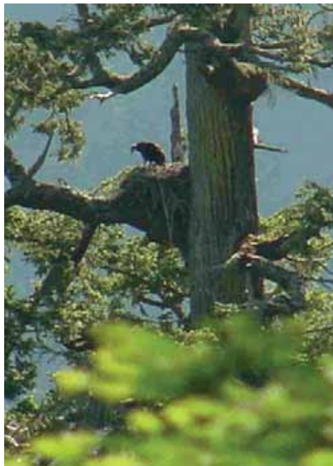
Golden eagle nest in old-growth Douglas-fir, Larabee Creek