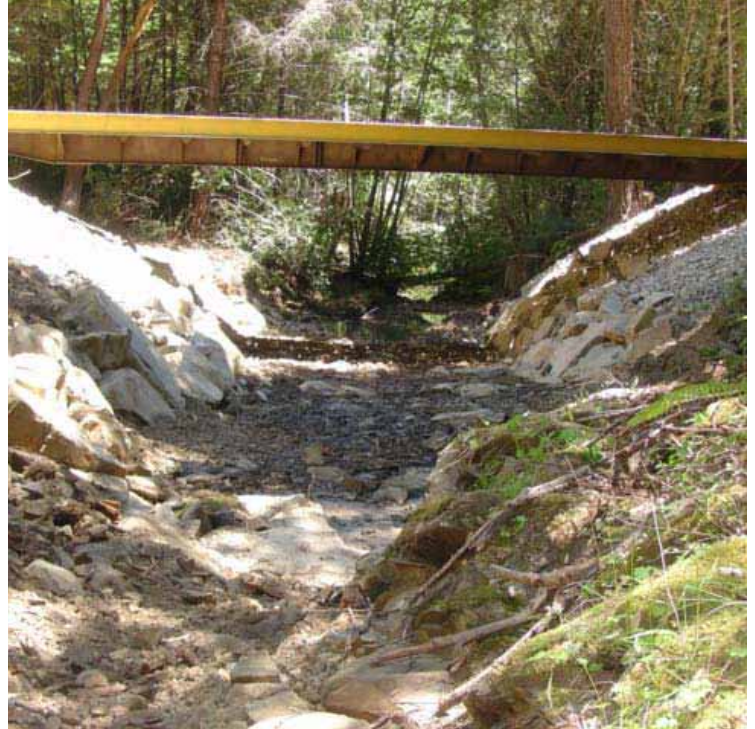
Restored Summer 2007

Little Waldron Creek – Hollowtree Watershed