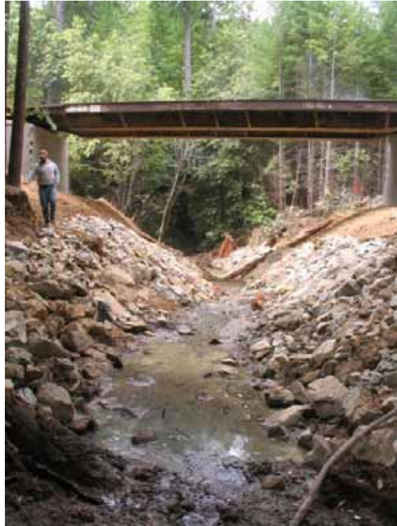
Bridge Replacement - 2009