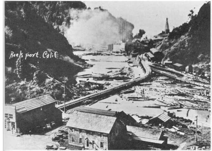
Rockport Beach – early 1900's