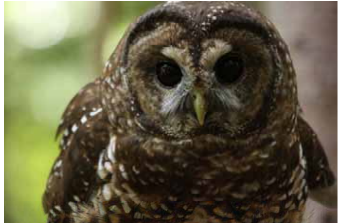
Northern Spotted Owl

Working with State and Federal agencies that oversee the protection of endangered species, MRC is near completion of a property-wide Habitat Conservation Plan (HCP) combined with a Natural Communities Conservation Plan (NCCP) and a Program Timberland Environmental Impact Report (PTEIR).