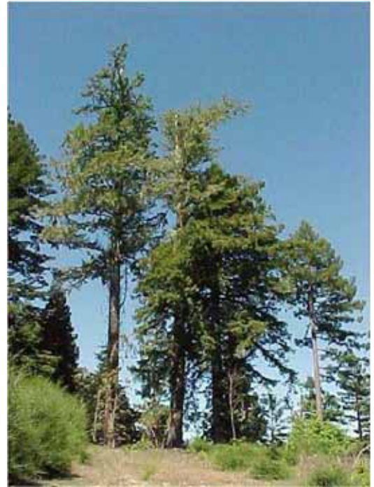
Old Growth In Navarro Watershed