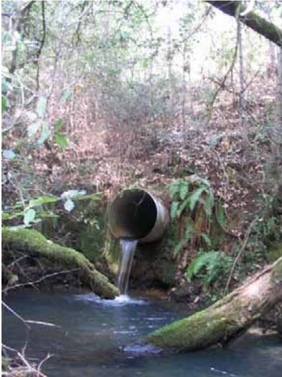
Culvert outlet - 2008