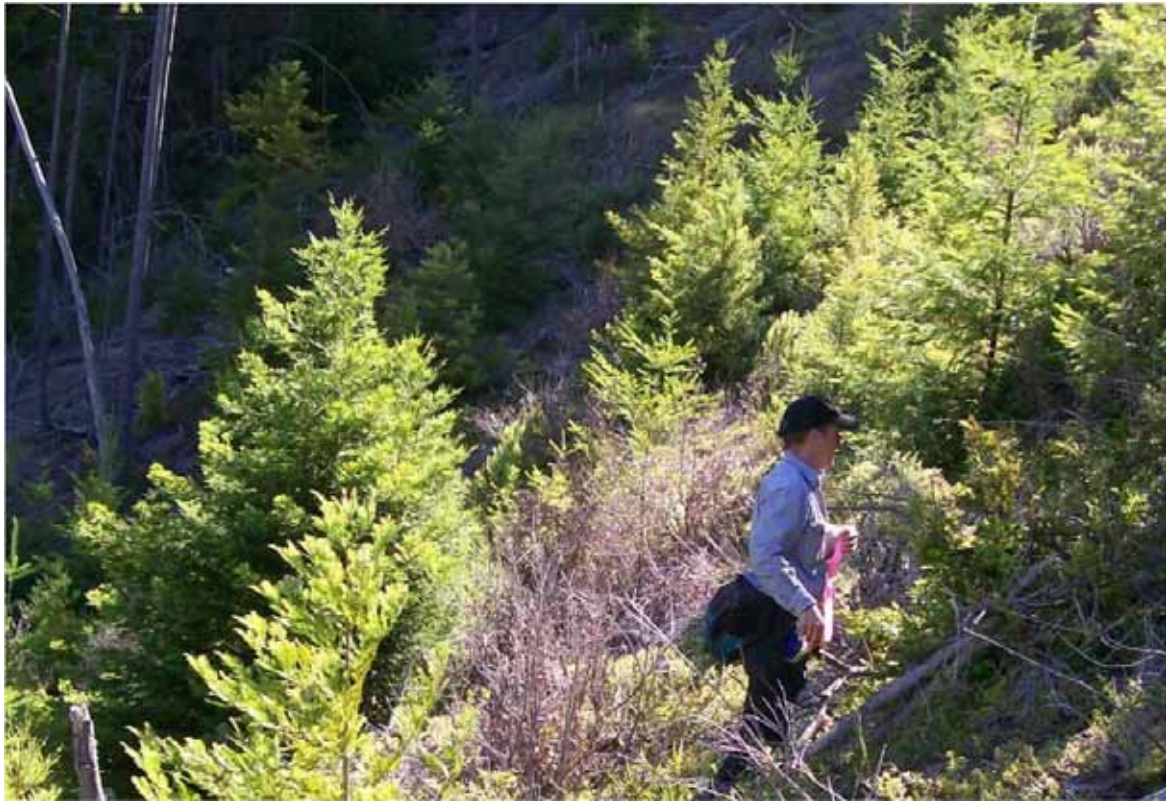
Replanted openings following Variable Retention harvest