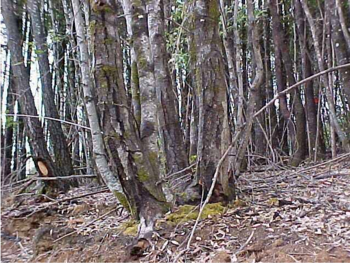
Tanoak dominated forestland