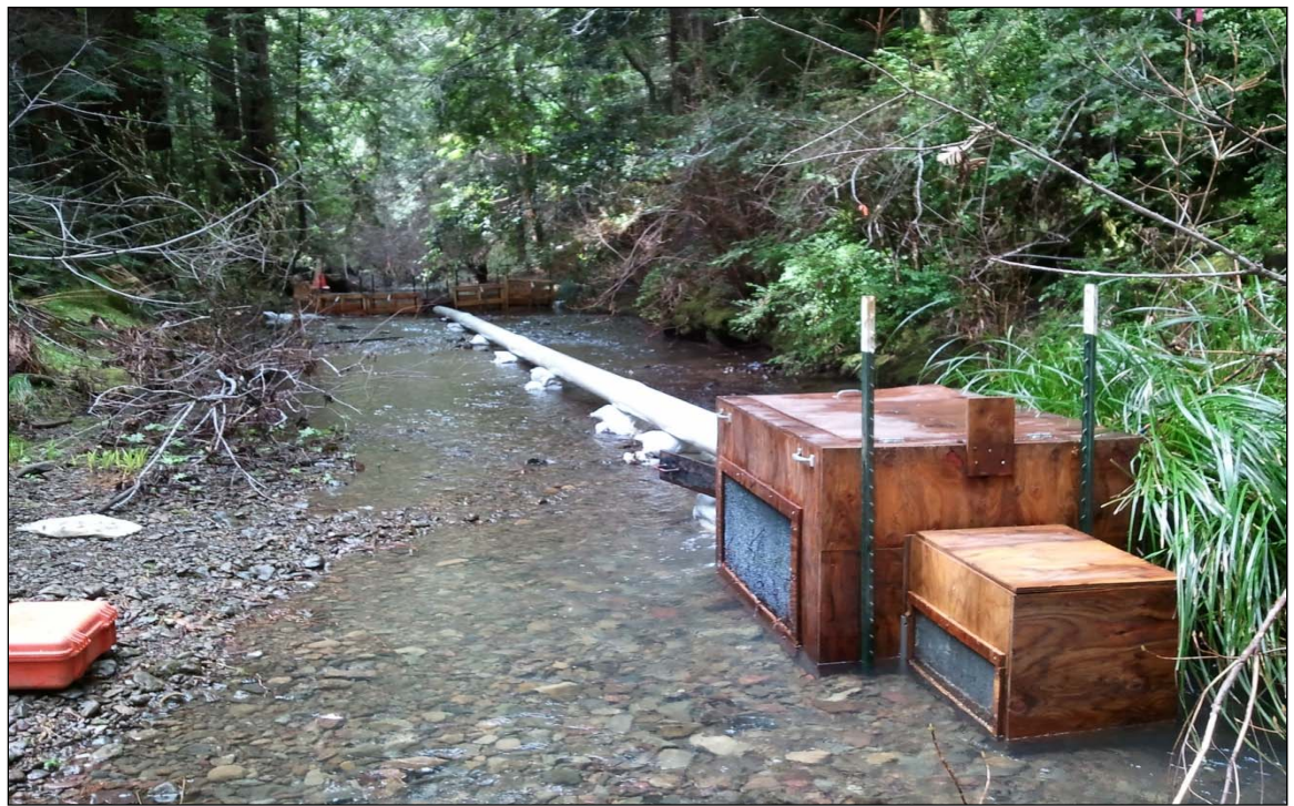
Figure 2. A pipe trap installed in South Fork Albion River 2012.