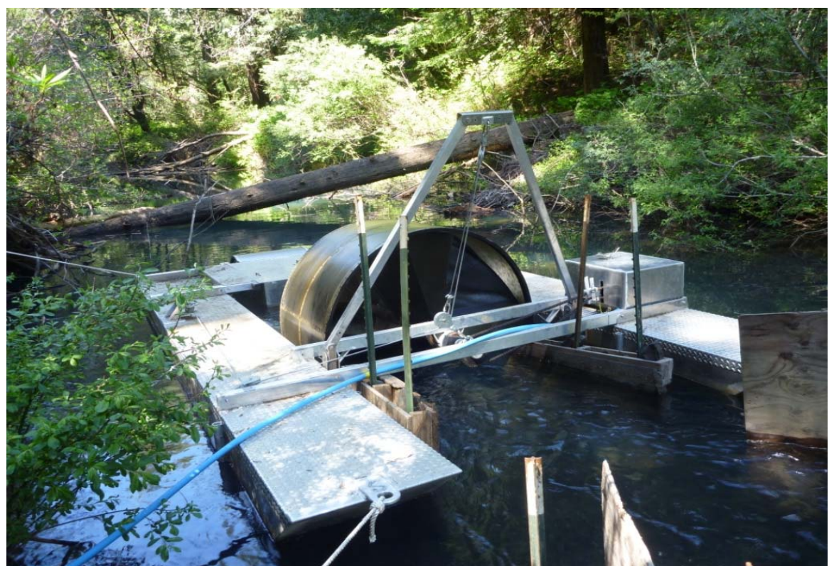
Figure 1. A motorized rotary screw trap in the North Fork Navarro River 2015.